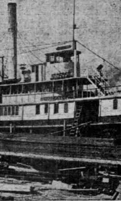
SWIFT STEERWHEELER TELEGRAPH, OF PUGET SOUND.

WILL SOON MAKE HER FIRST RUN ON THE COLUMBIA