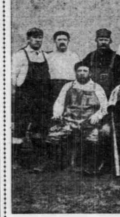
GRAY'S HARBOR LUMBERMEN BALLPLAYERS. HOQUIAM, Wash., June 19.—(Special.)—The Gray's Harbor lumbermen's baseball team will meet any team of any county of any state of the United States or Canada of their weight, the game to be played at the Exposition grounds at Portland, Or., on any date before September 15, 1905.