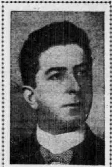
Clerk Municipal Court. b-----

ing the salary of the clerk of the Municipal Court $100, instead of $75, a month, the