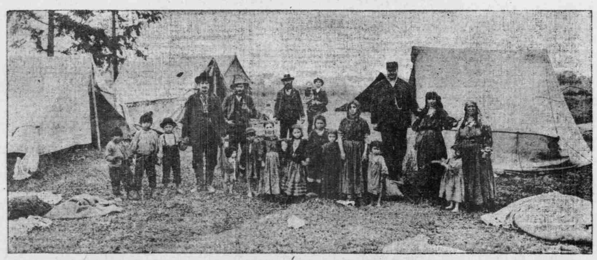
AT THE CAMP OF THE FORTUNE-TELLERS.

Township, driven from place to place, a band of gypsies reached Portland several days ago and camped in a vacant lot inside the corporate limits at a place on Milwaukee street.