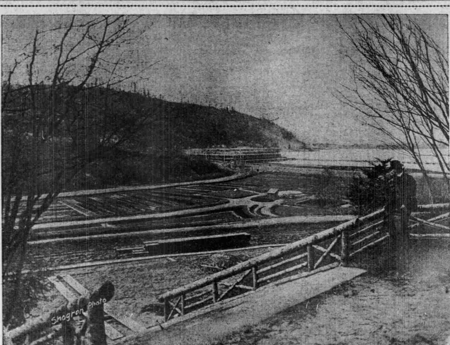
EXPERIMENTAL GARDENS AT THE LEWIS AND CLARK EXPOSITION, SHOWING THE AMERICAN INN IN BACKGROUND. Warm weather, with occasional showers, has brought the experimental gardens, which occupy the west side of the Lewis and Clark Exposition grounds, into a flourishing condition. Flowers, grasses and vegetables have pushed through the ground, turning the gardens into a bright green square. All the flowers and vegetable growth will be in the very best condition by the time of the opening of the Exposition, as trained gardeners will be constantly at work looking after the gardens, and no pains or expense will be spared to make them an attractive part of the Fair, as well as a practical demonstration of the wonderful productive qualities of Oregon soil and climate. In the background the American Inn, built partly over the lake shore, the framework of the mammoth building is well along towards completion, and a force of staffworkers and plasterers will be put to work there by the end of next week. It is intended to open the Inn early in May, or sooner if the 500-room building can be made ready.

It is probable that an entire special train will be required to carry the Pennsylvania delegation. Besides the large number of business men and sightseers who are coming, the City Council and Mayor of Philadelphia are considering the feasibility of making the trip. At a recent session of the Council the members were unanimously in favor of the junket across the continent to Portland, although definite action was not taken. They have planned to come with the famous Liberty Bell, which has been secured for the Exposition. The bell will be brought here in time for the