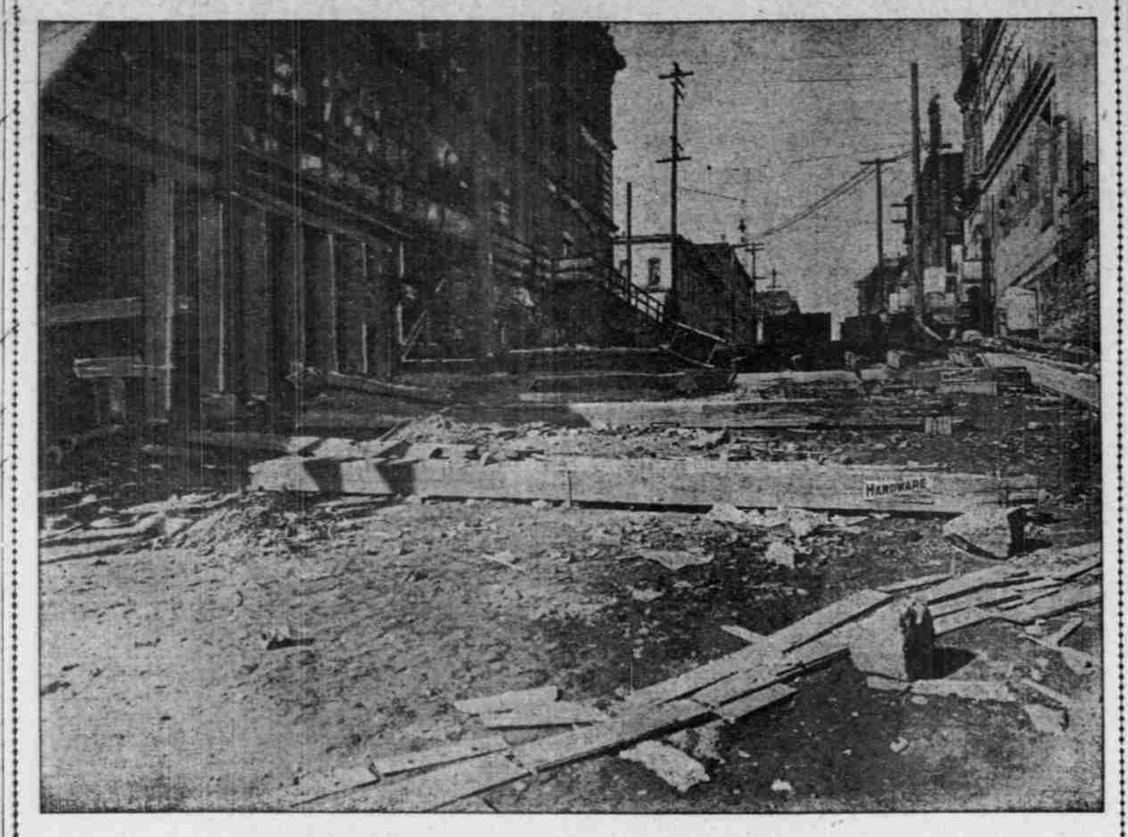
VIEW TAKEN AT RIVER'S EDGE LOOKING UP STARK STREET, SHOWING DEBRIS.

remain for several days after the big from the interior of Switzerland he has exhibit as a whole will represent Waxoo California demonstration. Connecticut has also asked for a special day, and July 5 was set apart yes-