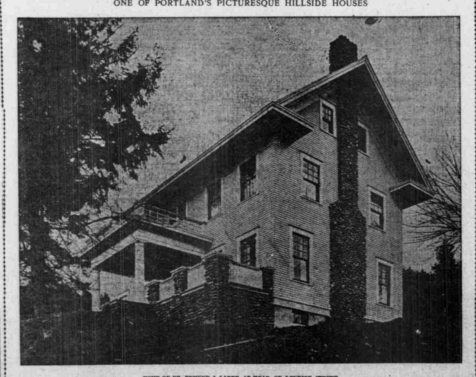
ONE OF PORTLAND'S PICTURESQUE HILLSIDE HOUSES

Special attention has been given to the sanitary features. The floor of the car is sealed and water tight and the edges