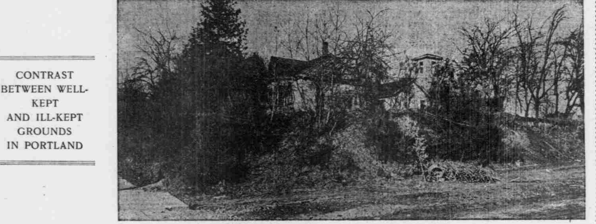
HEAVY UNDERBRUSH ON LOT AT EAST MADISON AND UNION AVENUE,