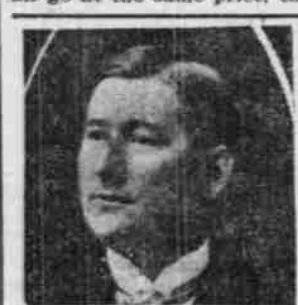
A Crowd-bringer to the Christmas Teaspor Book Shops

FANCY FEATHERS 10c FOR PEATHER TRIMMINGS WORTH TO 75c. 50 dozen pompons, wings, breasts, quills, birds, etc.; in every color. Values up to 75c. For Economy Sale 25C