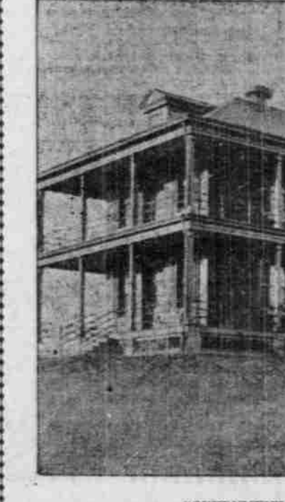
GOVERNMENT HOSPITAL JUST FINISHED AT VANCOUVER BARRACKS.