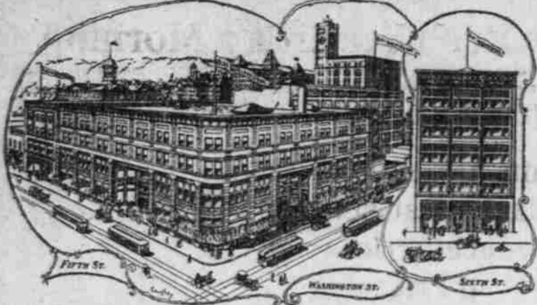
THE GREATER OLDS, WORTHMAN & KING STORES—FIFTH, SIXTH AND WASHINGTON STREETS.

We continue the remarkable values of the week strong in the belief that the store is creditably filling the void it has been built for. This week we celebrate the opening of the new Sixth-street Annex—an event that is the gate between the garden of blossoming endeavor and the field of ripened achievement. The hand of the public was on the latch—and it has thrown the gate wide open and accepted the great store in its new entirety as its own. The public has found it right in purpose, right in principle, right in conduct. In many things it is different from most stores, and in these things it is better. Its way is to find first what people want, then make it easy and comfortable for them to choose, then make the price easy to pay. To provide good merchandise, quality goods, of correct style at prices less than folk expect to pay—or would pay elsewhere. ISN'T THIS THE STORE YOU NEED?