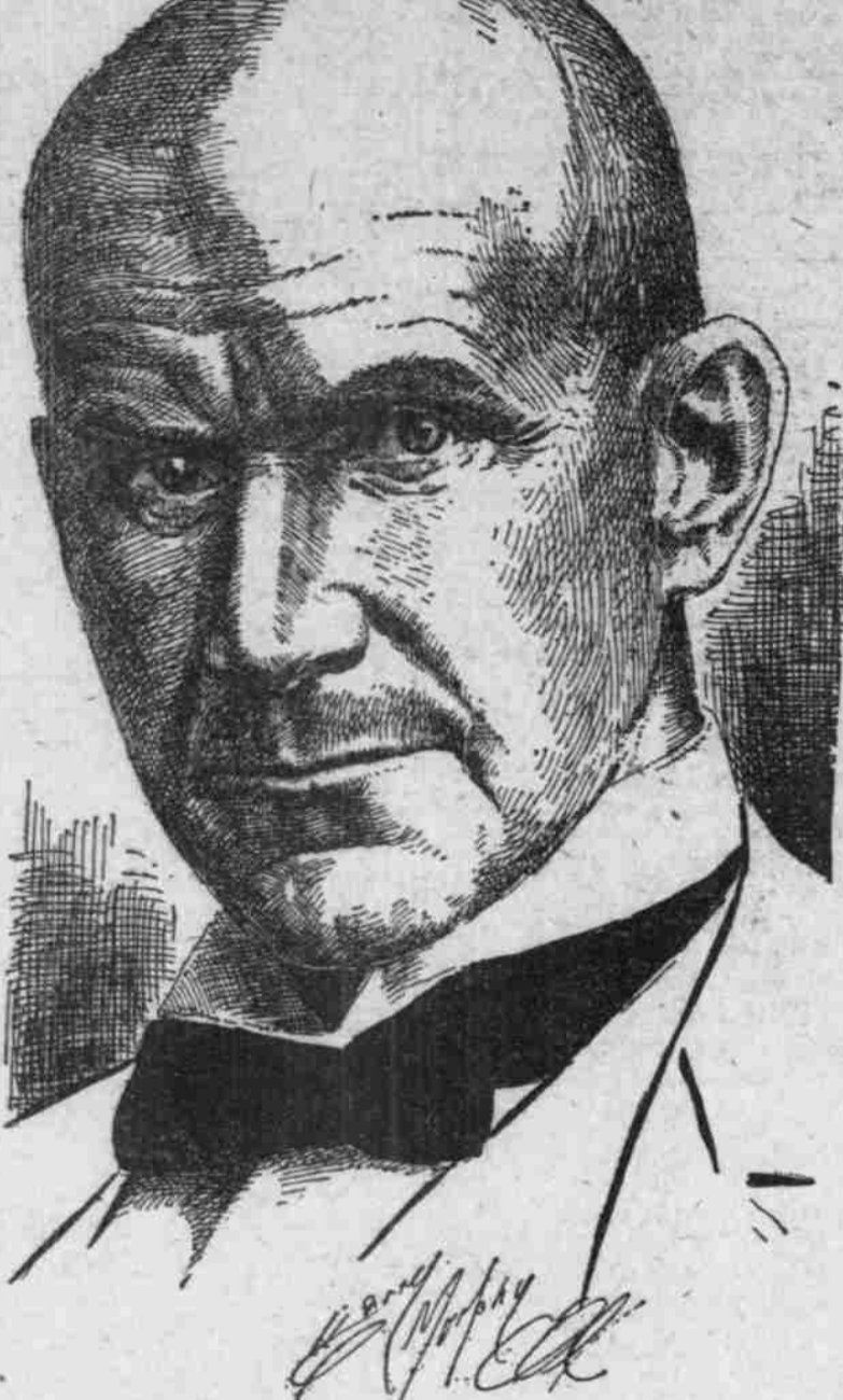
EUGENE V. DEBS.

SHERIFF'S DEPUTIES ARREST ELEVEN SMOKERS. Chinese Resorts Are Visited, but Only Those Men With Opium in Possession Taken in Custody.