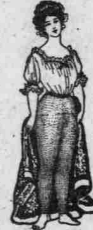
"MÉRODE" (Hand Finished) UNDERWEAR

Ladies' Merode White Lisle, low-neck, sleeveless Vests, extra silk trimmed—70c value, each... 49c Knee-Length Pants to match, each... 49c Ladies' White Cotton Lace-Front Vests, sleeveless—25c value, each... 16c Ladies' Black Gauze Lisle Hose, full finished, regular 50c value... 29c Misses' Black Lace Lisle Hose, sizes 6 to 8 1/2, 25c and 30c regular value, special at, pair... 18c Misses' White Vests and Pants, vests long sleeves, pants ankle length, 25c value, at, each... 18c