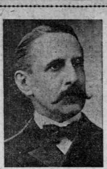
Hon. James A. Tawney, of Minnesota.