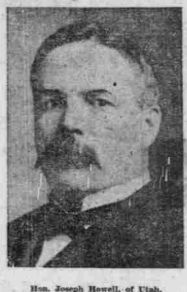
Hon. Joseph Howell, of Utah.