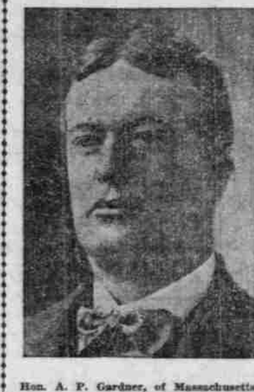
Hon. A. P. Gardner, of Massachusetts.