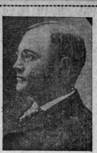
Hon. James S. Sherman, of New York.