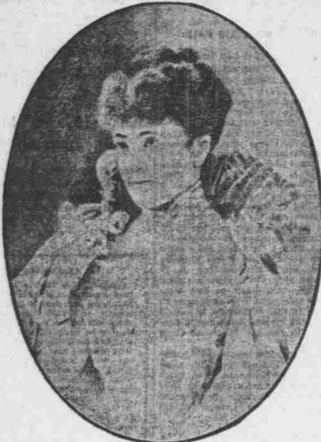
PORTLAND'S SOCIETY EVENT OF 1904

Want all to learn our method of doing business, our low prices on the world's best, standard makes of merchandise; our RELIABLE qualities, our almost endless assortments. Our special offerings this week will certainly keep interest unflagging for every one within the city gates. As one function follows another this convention week so does one bargain day follow another during this great, ANNUAL JANUARY CLEARANCE SALE AT PORTLAND'S BEST STORE. While the conventioners are talking "Stock" we're disposing of ours at prices that create a new record in Portland merchandising. VISITORS TO PORTLAND, WHY NOT COMBINE BUSINESS WITH PLEASURE WHILE IN THE CITY? YOU'RE IN THE RIGHT TOWN; COME TO THE RIGHT STORE. NOW IS THE RIGHT TIME TO BUY THE THINGS YOU NEED FOR USE AND WEAR, FOR A YEAR TO COME, AT PRICES THAT NEVER PREVAIL AT HOME. THE AMOUNT YOU SAVE IS ONLY REGULATED BY THE AMOUNT YOU BUY—HERE—NOW. WHAT YOU SAVE HERE WILL GO FAR TOWARD PAYING YOUR CONVENTION TRIP EXPENSES. This is a RELIABLE, comfortable, honest and home-like store where shopping is a delight; you'll not be troubled here by tales of neighborhood broils, this store sells merchandise but does not deal in calumny or invective. Its store news is self-respecting and dependable and never grovels in the slime of vituperation. The grand Christmas lesson has not been forgotten yet. You're best served at the "Different Store."