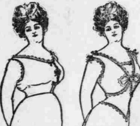
A Full Bust in an Ordinary Corset Cover. A Full Bust in La Grecque Bust Supporting Corset Cover.

For Ladies' Long Coats and Suits. These goods are decidedly novel. We have the only line of them in this city. Fancy mixed tweeds, red, blue, brown and black mixed. These are the goods the ladies have been running themselves weary trying to find. The supply is very limited, yet we carried every yard that came to this city. The many ladies who have been inquiring of us lately for this class of material will please take note of this. These goods, made up into long raincoats or suits, are simply elegant. Inside of the next 24 hours we will have out new models of these popular garments. They are in course of being designed and made today. The J. M. Acheson Co., merchant tailors, manufacturers of ladies' suits, coats and skirts ready to wear or special order. Fifth and Alder streets.