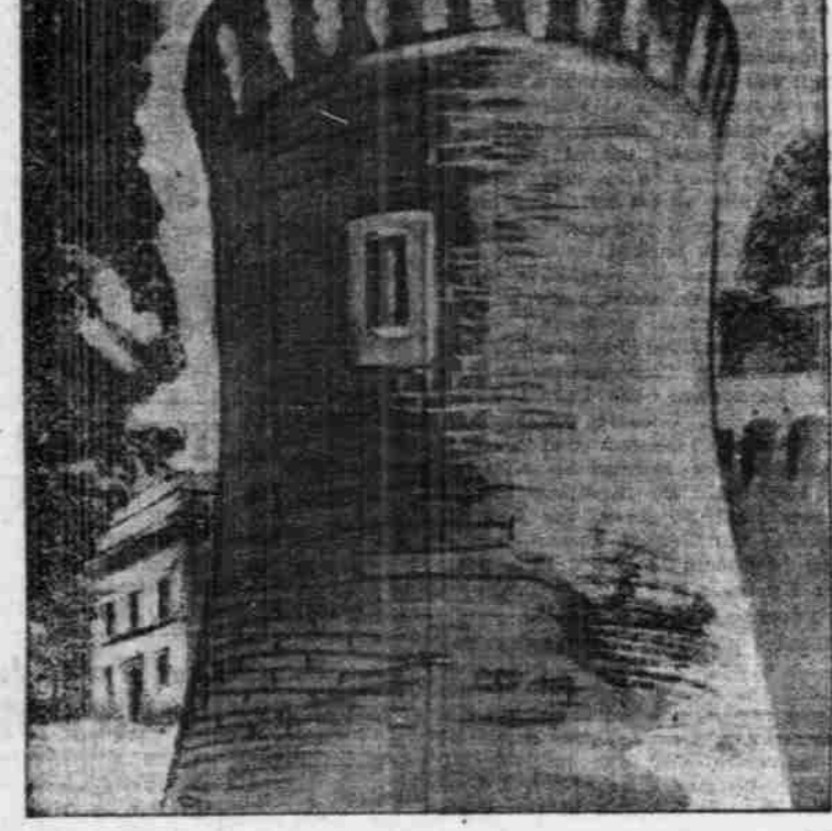
IN THIS IS THE POPE'S PRIVATE BEDCHAMBER—THE ONLY WINDOW OVERLOOKS ST. PETER'S.