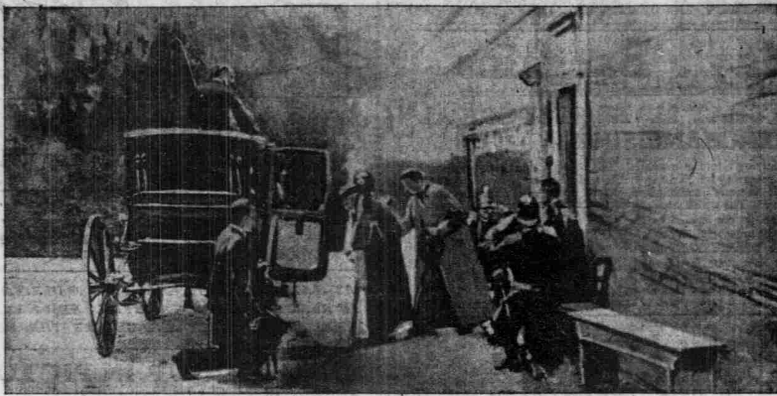
RECENT PHOTOGRAPH SHOWING POPE LEO ENTERING HIS CARRIAGE FOR A DRIVE AROUND THE VATICAN GROUNDS.

(Continued from First Page) wish to see myself these bulletins in their exact text. I have already seen and meditated on that of last night. He then went on speaking about the cause of his illness.