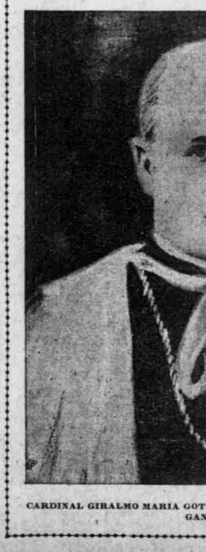
CARDINAL GIRALMO MARIA GOTTI, PREFECT OF THE PROPAGANDA.