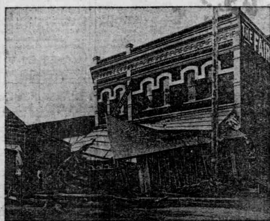
DEBRIS IN FRONT OF THE FAIR ON MAIN STREET.