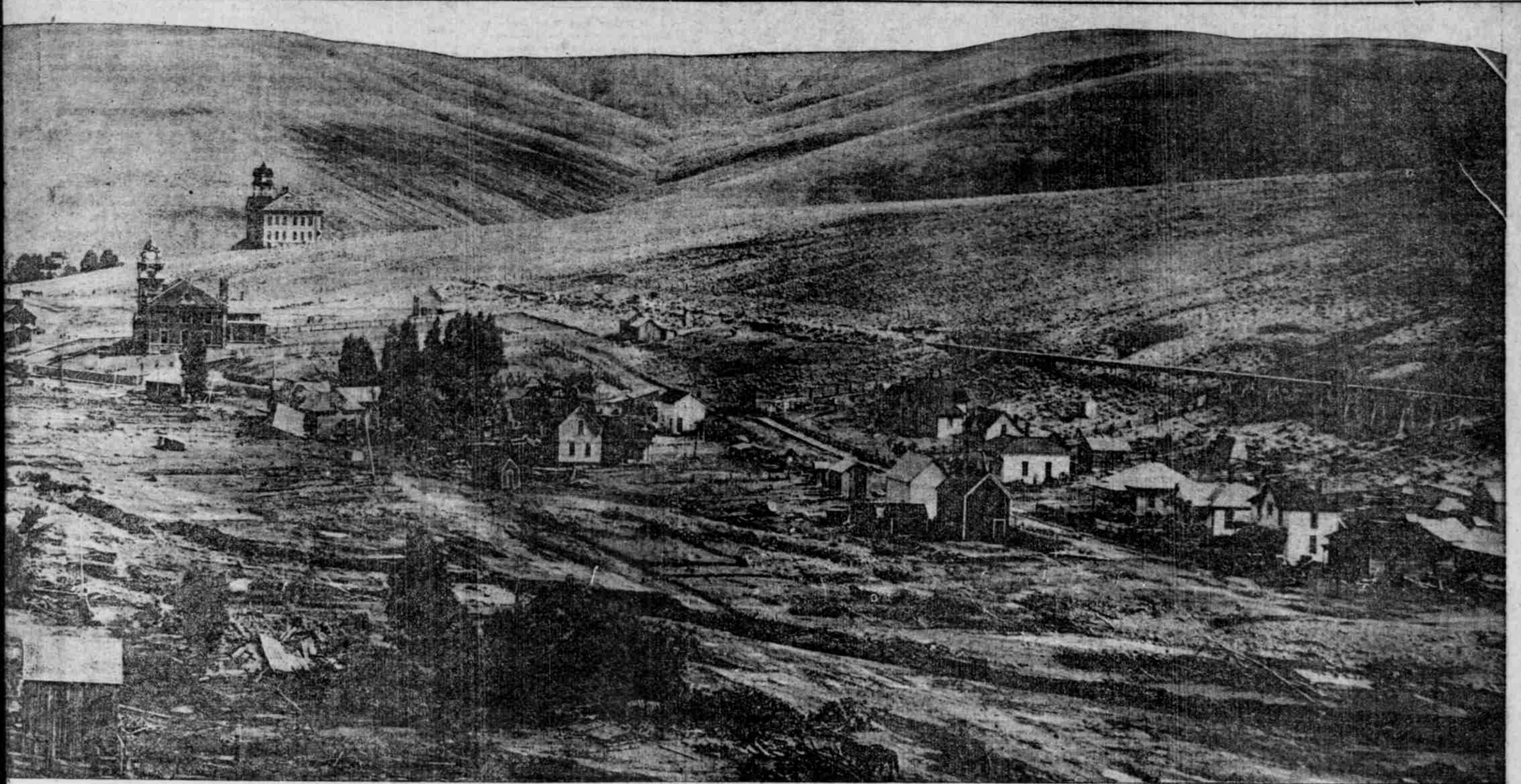
EVERY TOWN LOT BUT ONE ON THE BARE SPACE WAS OCCUPIED BY A DWELLING, AND ALL WERE CARRIED AWAY BY THE WATER. THE COURSE OF THE DELUGE WAS FROM RIGHT TO LEFT.