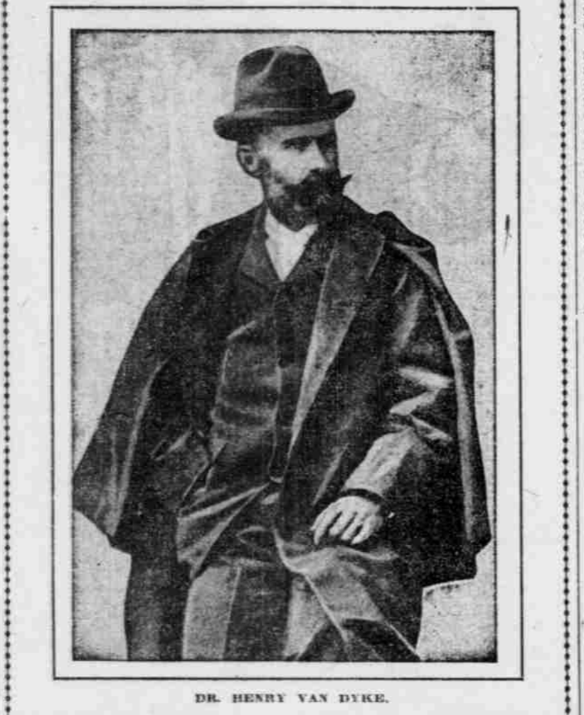
DR. HENRY VAN DYKE.