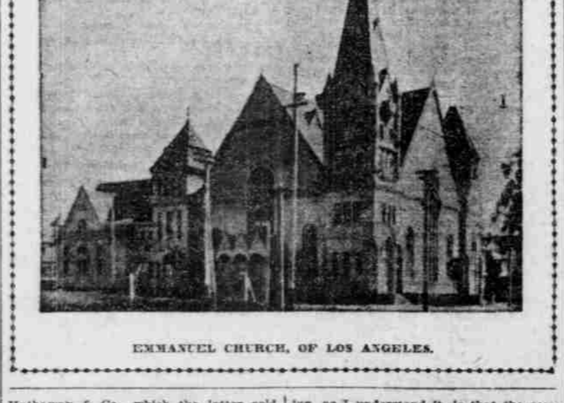
EMMANUEL CHURCH, OF LOS ANGELES.

Hathaway & Co., which the latter sold or discontinued. Two of these notes for $500 each were given to the First National Bank of Chicago for collection; two more of the same face value to the Corn Exchange National Bank, and another for $500 to the Commercial National Bank. The concern is alleged to have discounted other commercial paper of great value, though the receivers have not been able to ascertain who got these papers.