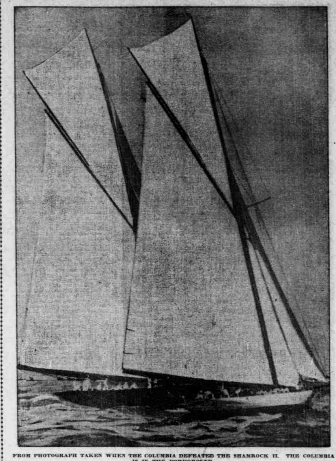
FROM PHOTOGRAPH TAKEN WHEN THE COLUMBIA DEFEATED THE SHAMROCK II. THE COLUMBIA IS IN THE FOREGROUND.

Race King won, Miss Shylock second, Waco third; time, 1:04 1/2. Six furlongs, selling—Orloff won, Star and Garter second, North Brook third; time, 1:44 4/5.