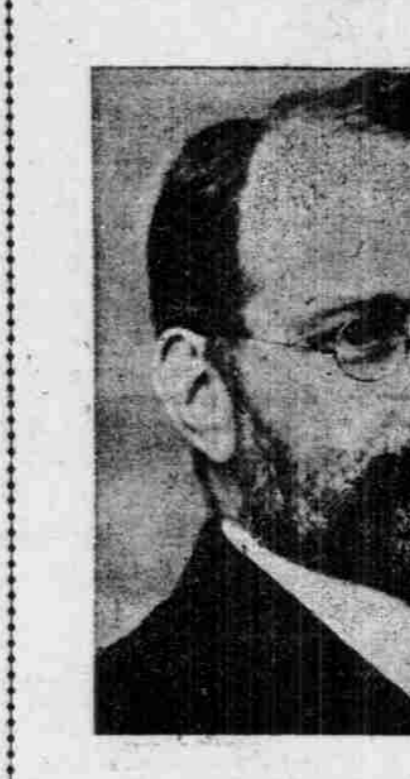
Dr. George C. Pardee, Rep.