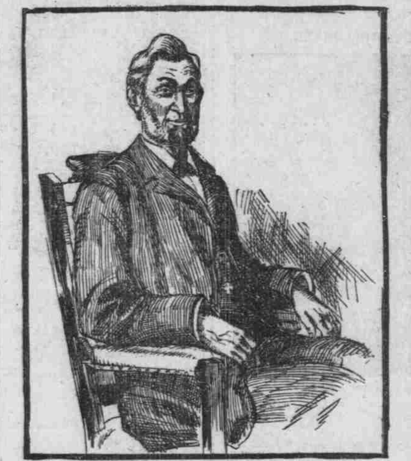
MEMBER OF STATE LEGISLATURE, WHO DIED SUNDAY.

the municipal candidates will address the citizens of Sellwood at Fremont's Hall this evening.