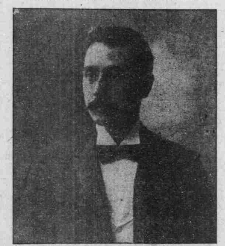
WHO IS WORKING FOR THE OSAKA 1903 EXPOSITION.