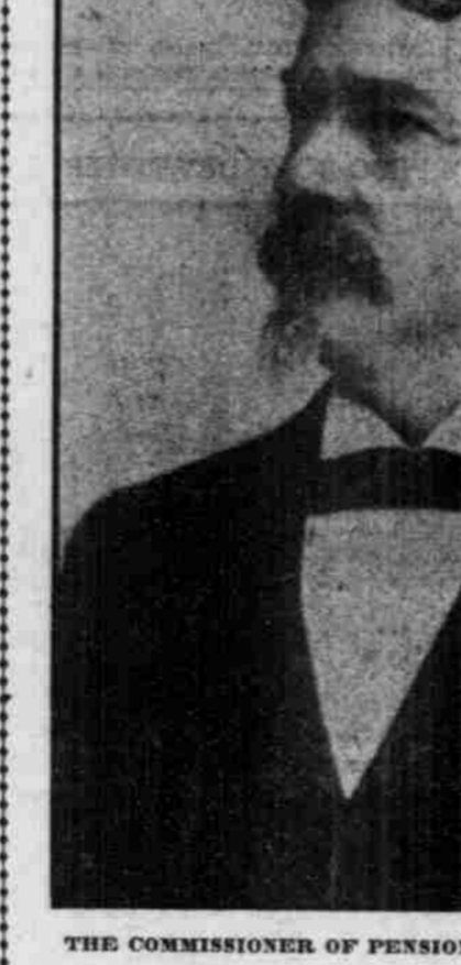
THE COMMISSIONER OF PENSIONS HANDS IN HIS RESIGNATION.

United States Senate, and each has made a thorough canvass. At the respective headquarters in this city tonight, each side, with apparent confidence, claims victory tomorrow. The direct vote in the primary elections will govern Democratic nominations for the Legislature by which Senator Jones' successor will be chosen next January.