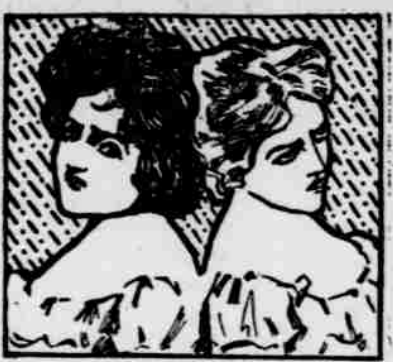
IT MAKES WOMEN HAPPY.

Saloon-Keepers Frightened Out. NEW YORK, Feb. 17.—Agitation regarding the Sunday closing of saloons, and especially of violations of the excise law