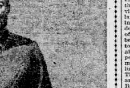
General Dewet. Who escaped through Kitchener's military line.

General Dewet. WHO ESCAPED THROUGH KITCHENER'S MILITARY LINE.