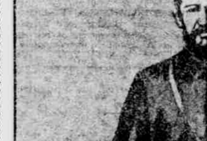
General Dewet. Who escaped through Kitchener's military line.

General Dewet. WHO ESCAPED THROUGH KITCHENER'S MILITARY LINE.