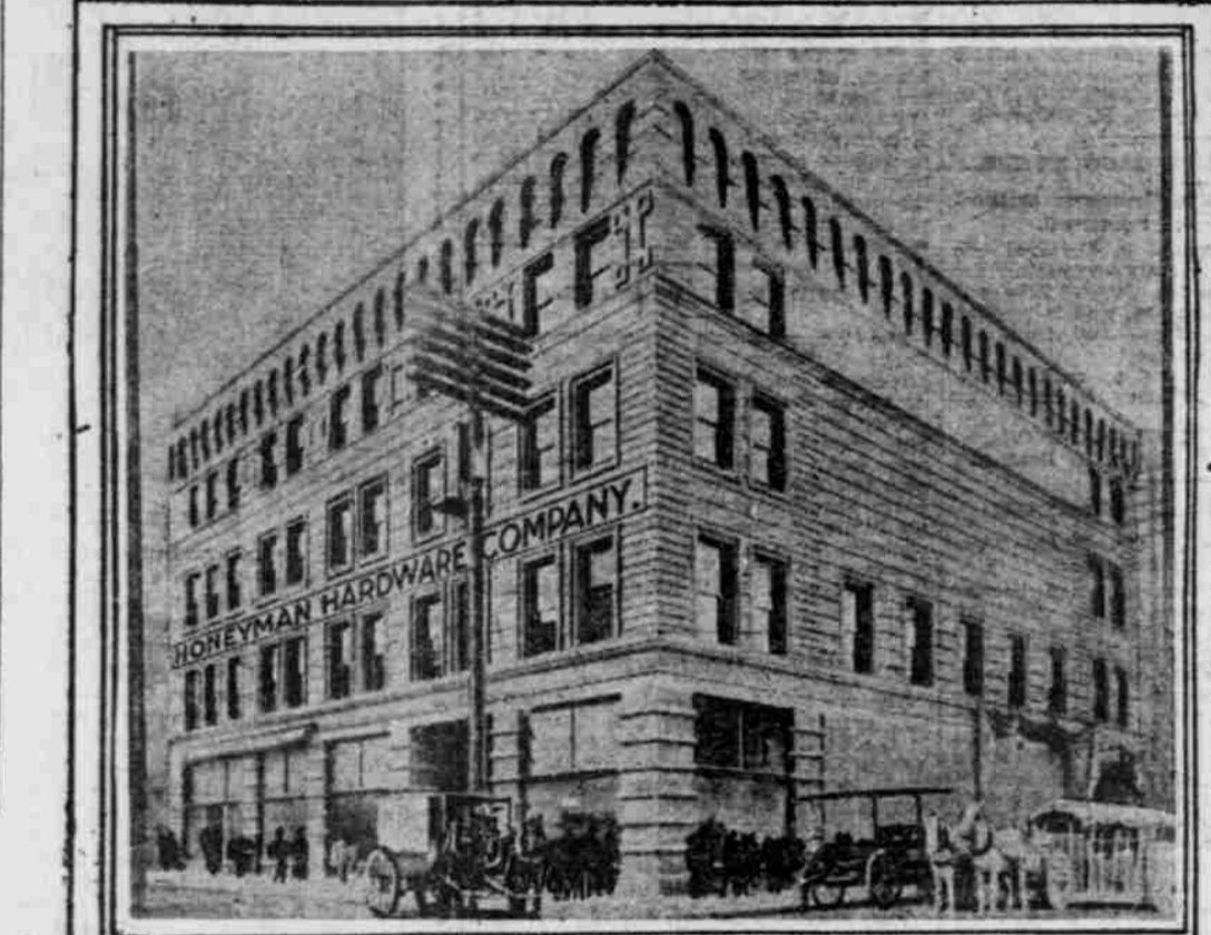
HONEYMAN HARDWARE COMPANY ONE OF THE LARGEST HOUSES DEALING IN HARDWARE ON THE COAST