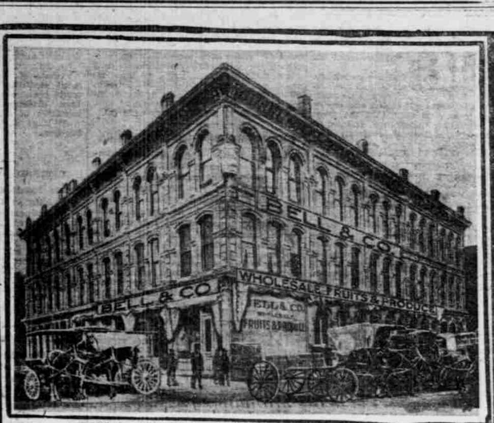
BELL & CO. WHOLESALE PRODUCE