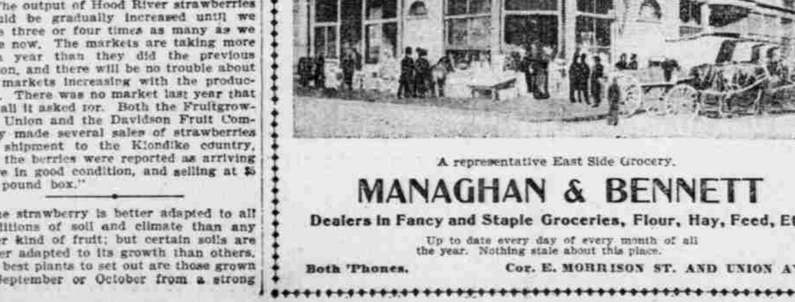
A representative East Side Grocery. MANAGHAN & BENNETT Dealers in Fancy and Staple Groceries, Flour, Hay, Feed, Etc.

Tuition fees are $100 per boarding pupil, and from $40 to $50 per annum, according to the classes, for day pupils. There in good condition, and selling at $2 per pound box.