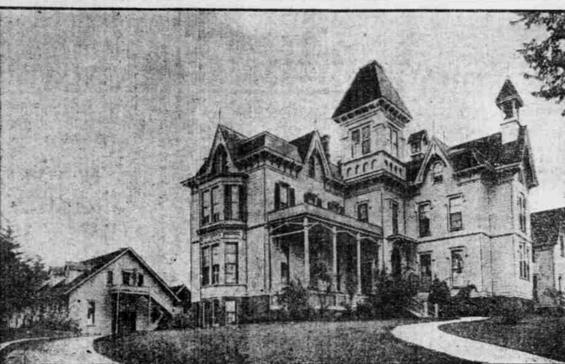
Among Portland's educational institutions none stands higher than the Bishop Scott Academy. For over 20 years it has maintained its lofty position, and has never been so comfortably and completely equipped as it is at present.

It is situated in the center of the most desirable portion of the City of Portland, Or., occupies four city blocks of space, and is perfect in its appointments. The buildings were entirely renovated and refurbished last Summer, and present a very attractive appearance, affording every facility for the comfort and well-being of the students.