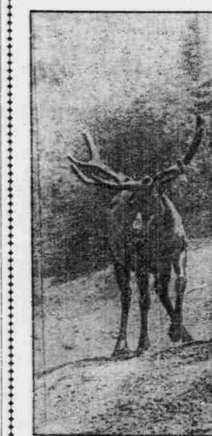
HERD OF OREGON ELK.

The higher institutions of learning, both public and independent, have their courses of study so extended that their graduates have no difficulty in entering Western colleges without re-examination.