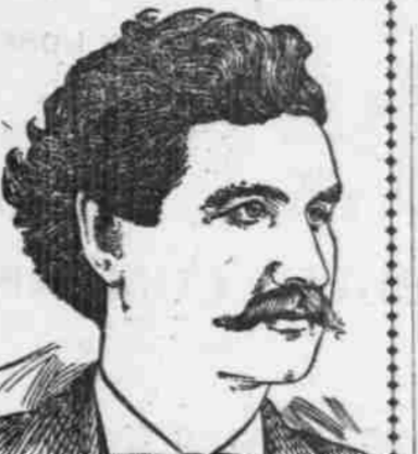
Congressman F. Y. Fitzpatrick.

Hon. F. Y. Fitzpatrick, Congressman from Kentucky, writes from the National Hotel, Washington, D. C., as follows: