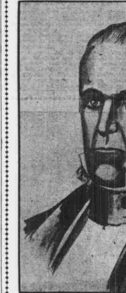
JAMES K. POLK.

James K. Polk was elected President of the United States in 1844, on a platform which declared the title of the United States to Oregon to be clear and indisputable.