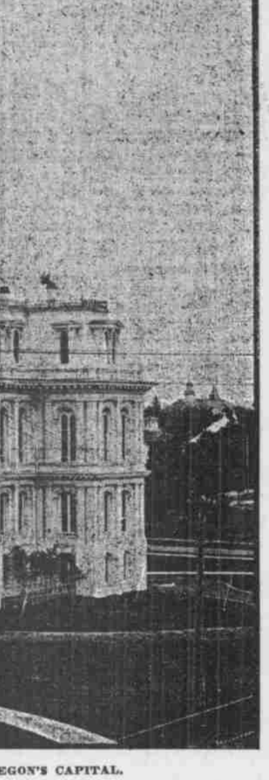
ONE OF THE PRINCIPAL SIGHTS TO BE SEEN AT OREGON'S CAPITAL.