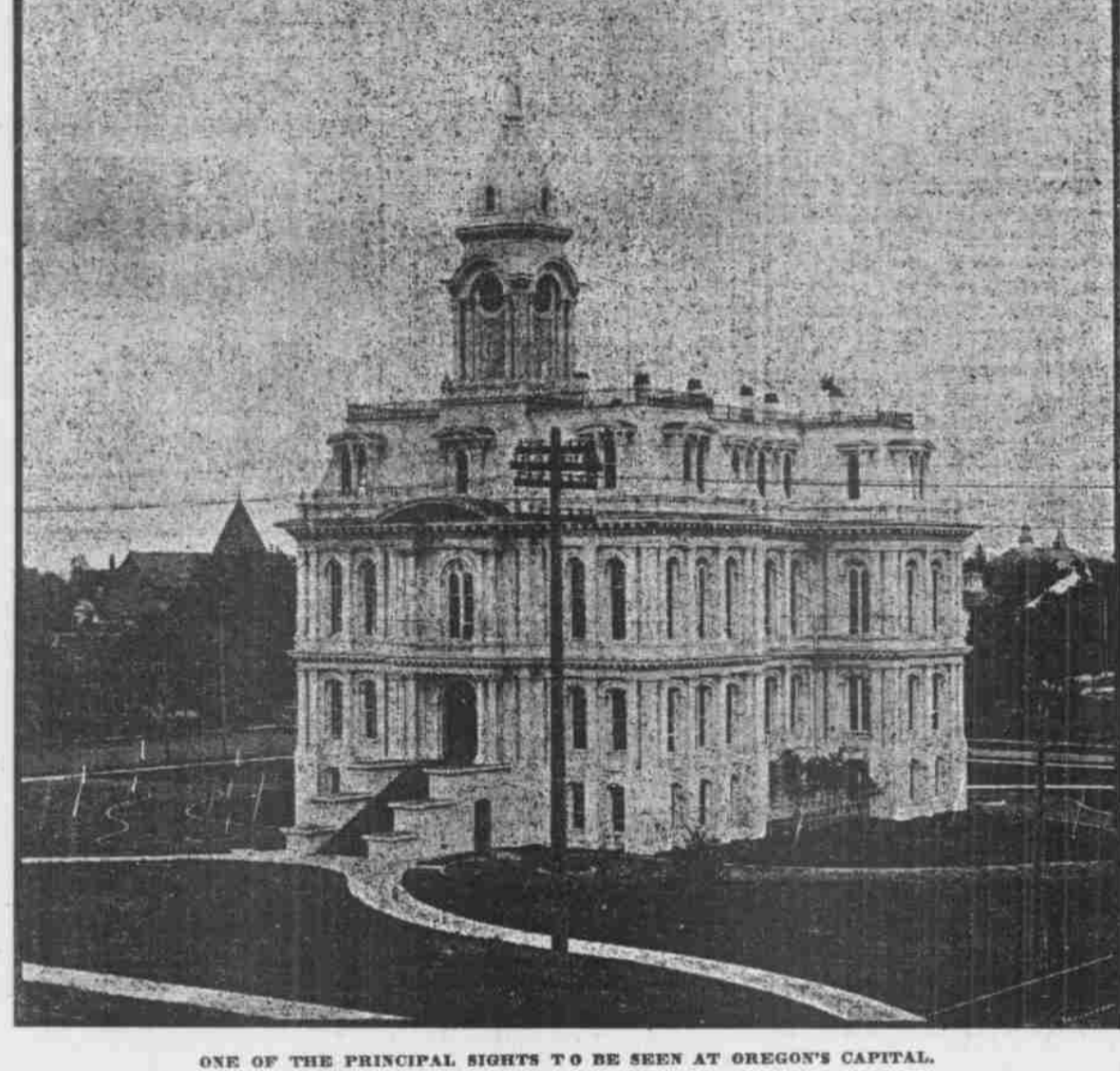
ONE OF THE PRINCIPAL SIGHTS TO BE SEEN AT OREGON'S CAPITAL.

denial. He based his case upon the evidence tending to support the theory that the shooting was accidental, and that in firing the pistol his motive had been to protect his property by scaring off the young hoodlums. The letter, he argued, belonged to the "S. S." organization, and should not be encouraged in their career of reckless wrong-doing.