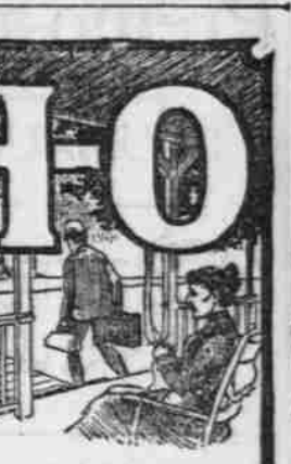
Alone she sits—poor Widow Lee—Hard-featured, thin and miserly—And wonders why no boarders stay Beneath her roof more than a day.

320 Wash. St. bet. Sixth and Seventh. 223 First Street, near Salmon.