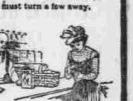
Just watch these two L'Amour girls—You'll find Miss Sears will buy M-O—She thinks the best is none too good, Especially when buying food.