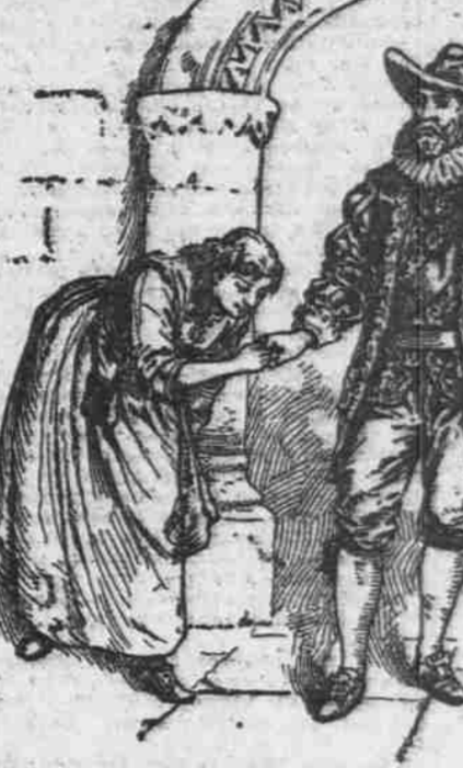
THE SOURCE OF CIVILIZATION.