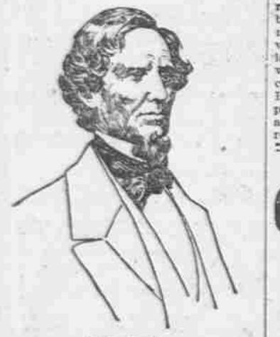
John Cabell Breckinridge.

BAILEY GATZERT (Alder-street) Docks. Leaves Portland daily every morning at 7 o'clock, except Sunday. Returning, leaves Astoria every night at 7 o'clock, except Sunday. Oregon phone Main 351. Columbia phone 341.