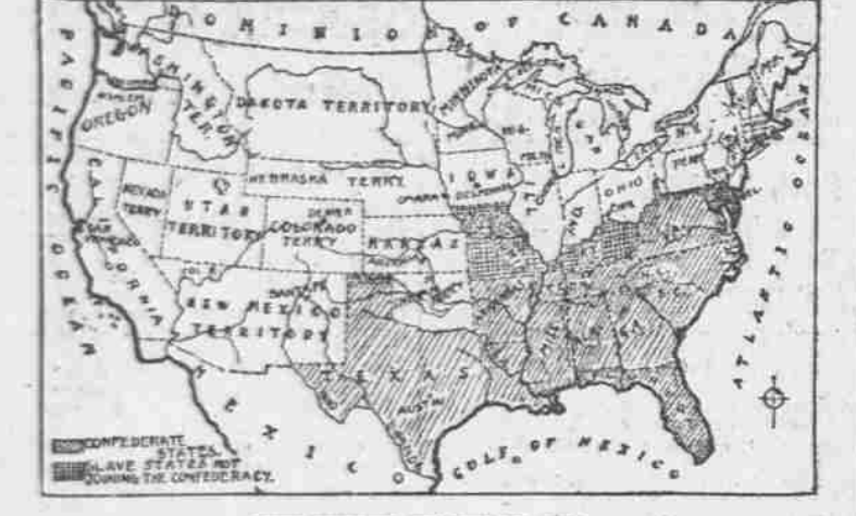
THE UNITED STATES IN 1861.

whoever which could make slavery legal in any territory; demanded the adoption of Kansas, the adoption of a protective policy (this secured the adherence of Pennsylvania) and the passage of a homestead law while any change in the naturalization laws was opposed.