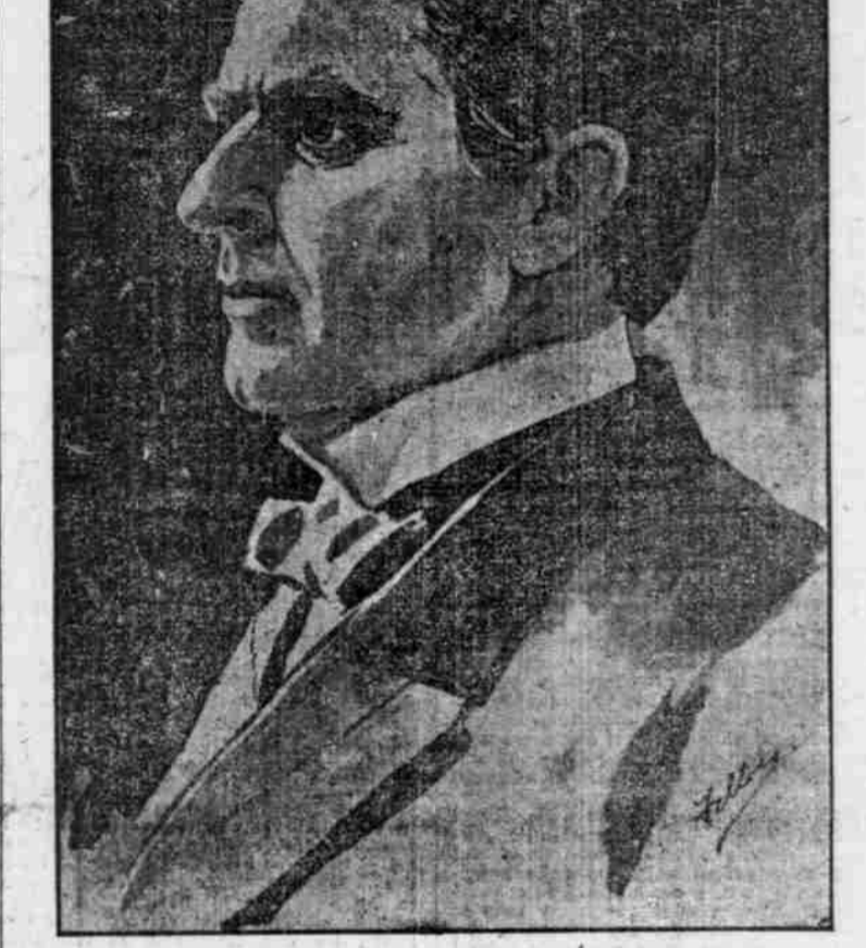
RENOMINATED FOR PRESIDENT BY THE REPUBLICAN NATIONAL CONVENTION.

WILLIAM MCKINLEY. A portrait of William McKinley, President of the United States.