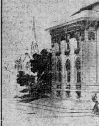
THE PROPOSED FEDERAL BUILDING IN SALEM, OREGON.

A site, and $50 for making surveys. An attempt is being made to have $100,000 additional appropriated, so that $100,000 in the clear can be expended on the building proper. The block upon which the building will be erected is bounded by State, Church, Court and Cottage streets. The block offered by the city was the most centrally located of any offered, and was the lowest in price of any that would be at all suitable. The city received $7500 for the block of land, and half of this sum was paid to the Wilson heirs. The block is 348 feet long on State street by 331 on Church. It has a street 60 feet wide on every side.