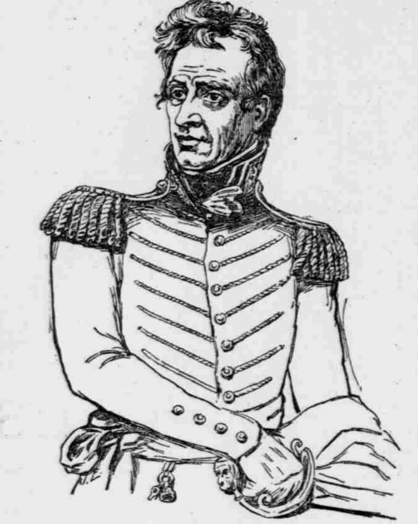
ANDREW JACKSON. (From a painting by Vanderly in the City Hall, New York.)

Direct Route to Kootenay Mining District British Columbia Canadian Pacific Ry. SOO PACIFIC LINE