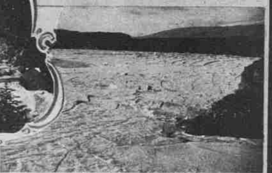
Ice Jam in Columbia River at The Dalles, Wash. '98-'99