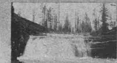
Rock Creek Falls, Cowitz County, Wash.