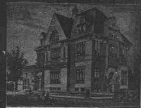
Medical Department, University of Oregon Portland