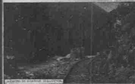
Scene Along Oregon Central & Eastern R. R., Western Oregon