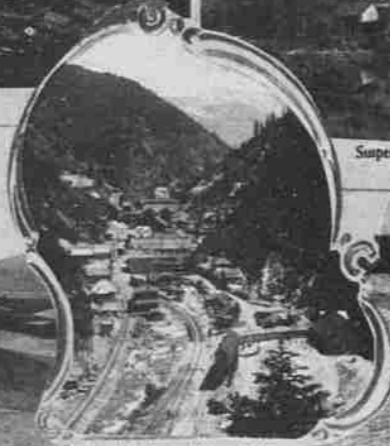
Barks in the Coeur d'Alenes, Idaho