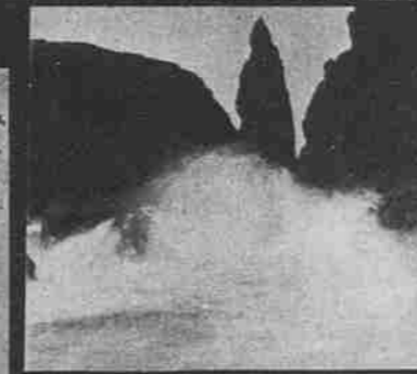
UPPER FALLS ELK CREEK