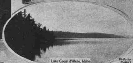
Lake Coeur d'Alene, Idaho