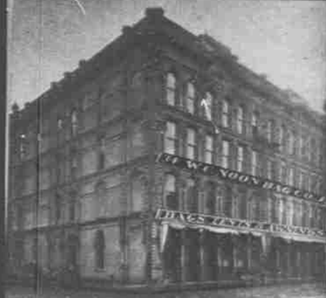
W. C. Noon Bag Co., First and Couch Sts., Portland The Largest House of its Kind on the Pacific Coast