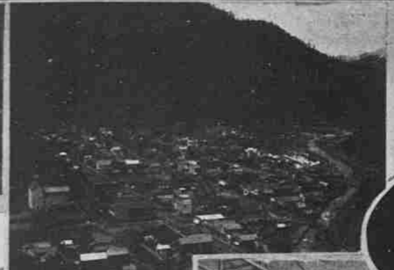
Wallace in the Coeur d'Alenes, Idaho