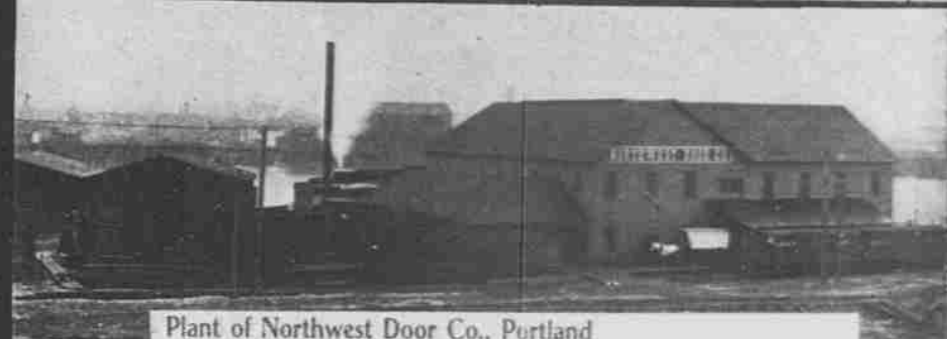
Plant of Northwest Door Co., Portland