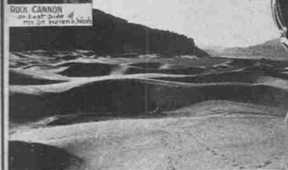
A Sea of Sand "Among the Breakers." Line O. R. & N., East of The Dalles, Or.