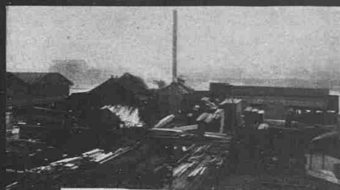
Plant of Albina Lumber Co., Portland