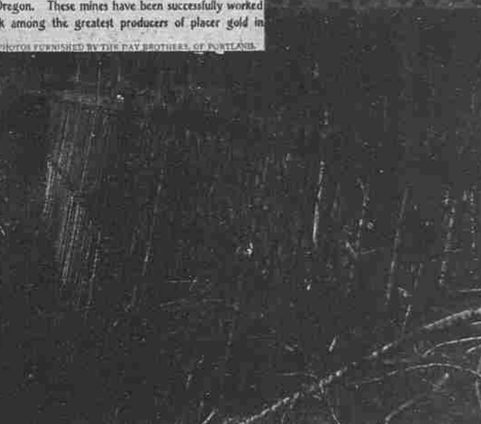
HIGH TRESTLE WHICH SUPPORTS FLUME CARRYING WATER TO A PLACER MINE