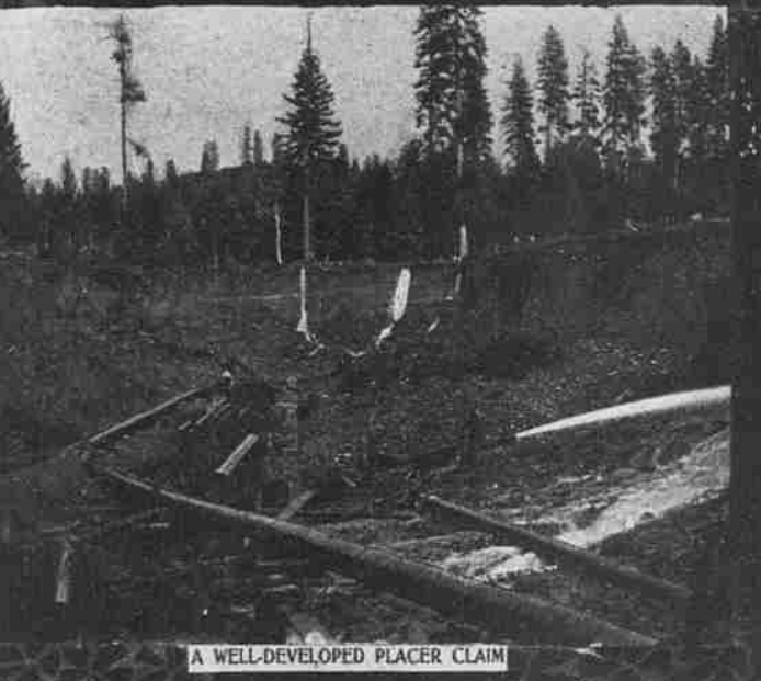
A WELL-DEVELOPED PLACER CLAIM

In Western Oregon the principal gold fields are the Santiam district in Linn county, the Bohemia district in Lane and Douglas, and the placers and quartz districts of Douglas, Jackson, Josephine, Coos and Curry. Vast capital has been invested in Oregon mines during the past two years. American, English and French investors are reaching out for every good mine in Eastern Oregon gold belt. Outside capital is also finding its way into Western Oregon mines. It is the producing mine or the one which tests have shown to be rich that attracts capital. This fact explains recent heavy investments in Oregon mines by Portland, Spokane, New York, Butte, Salt Lake, Wyoming and foreign capitalists. Experience having proved that Oregon's mines are rich and permanent, an era of extensive development is close at hand. It will not be many years before the annual gold production of the state will be $10,000,000, perhaps $20,000,000.