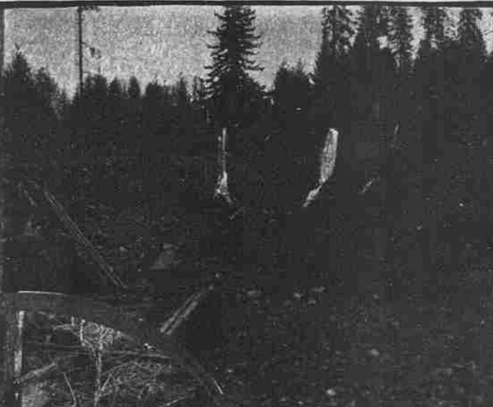
OPENING A NEW PLACER MINE

The rich placer deposits of Southern Oregon. These mines have been successfully worked for nearly half a century; and they still rank among the greatest producers of placer gold in the United States.