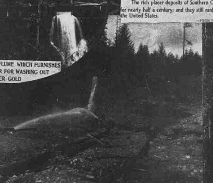
TWO 8-INCH GIANTS PLAYING ON A 40-FOOT BANK OF GRAVEL