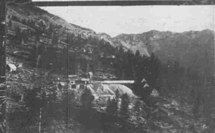
IN BAISLEY-ELKHORN MINING DISTRICT. THE MINES OF THIS DISTRICT ARE AMONG THE GREATEST GOLD-PRODUCERS OF THE WORLD