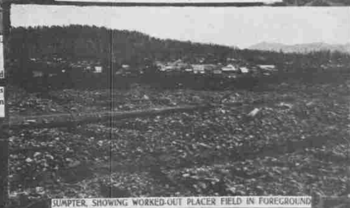
SUMPTER, SHOWING WORKED-OUT PLACER FIELD IN FOREGROUND