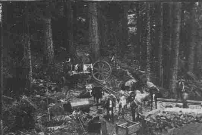
FREIGHTING HEAVY MACHINERY OVER MOUNTAIN TRAIL TO NEW AND RICH GOLD-QUARTZ FIELD OF THE BOHEMIA MINING DISTRICT, EAST OF EUGENE AND COTTAGE GROVE, OR.