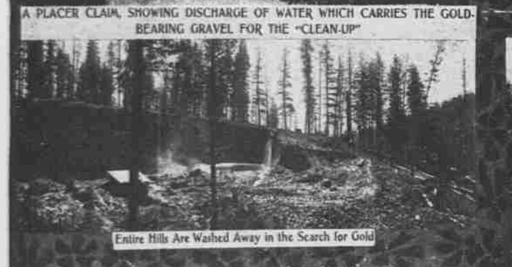
A PLACER CLAIM, SHOWING DISCHARGE OF WATER WHICH CARRIES THE GOLD-BEARING GRAVEL FOR THE "CLEAN-UP"