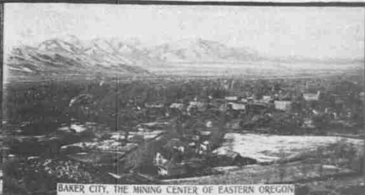
BAKER CITY, THE MINING CENTER OF EASTERN OREGON

Oregon is destined to become one of the great mining states of the Union. Already its annual production of gold approximates $4,000,000 and this total will steadily increase from now on.