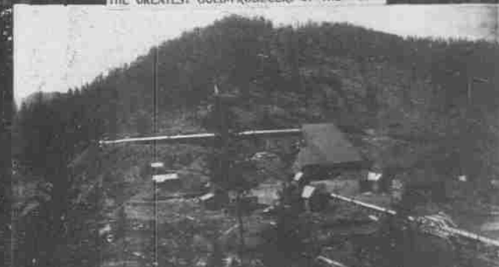
A FAMOUS GOLD-QUARTZ MINE AT GRANITE EASTERN OREGON MINES, IN VICINITY OF BAKER CITY