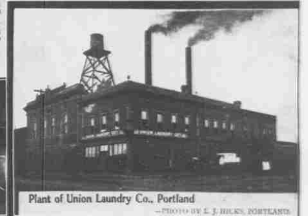
Plant of Union Laundry Co., Portland