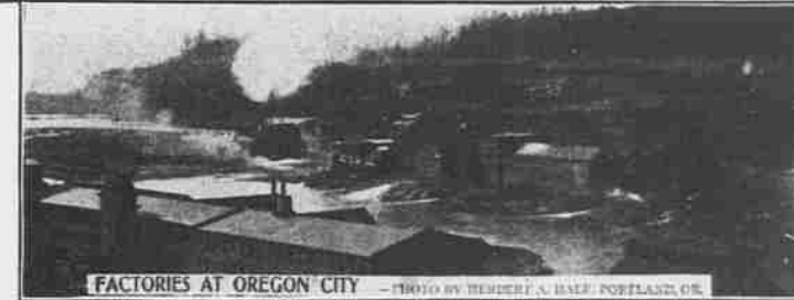
FACTORIES AT OREGON CITY