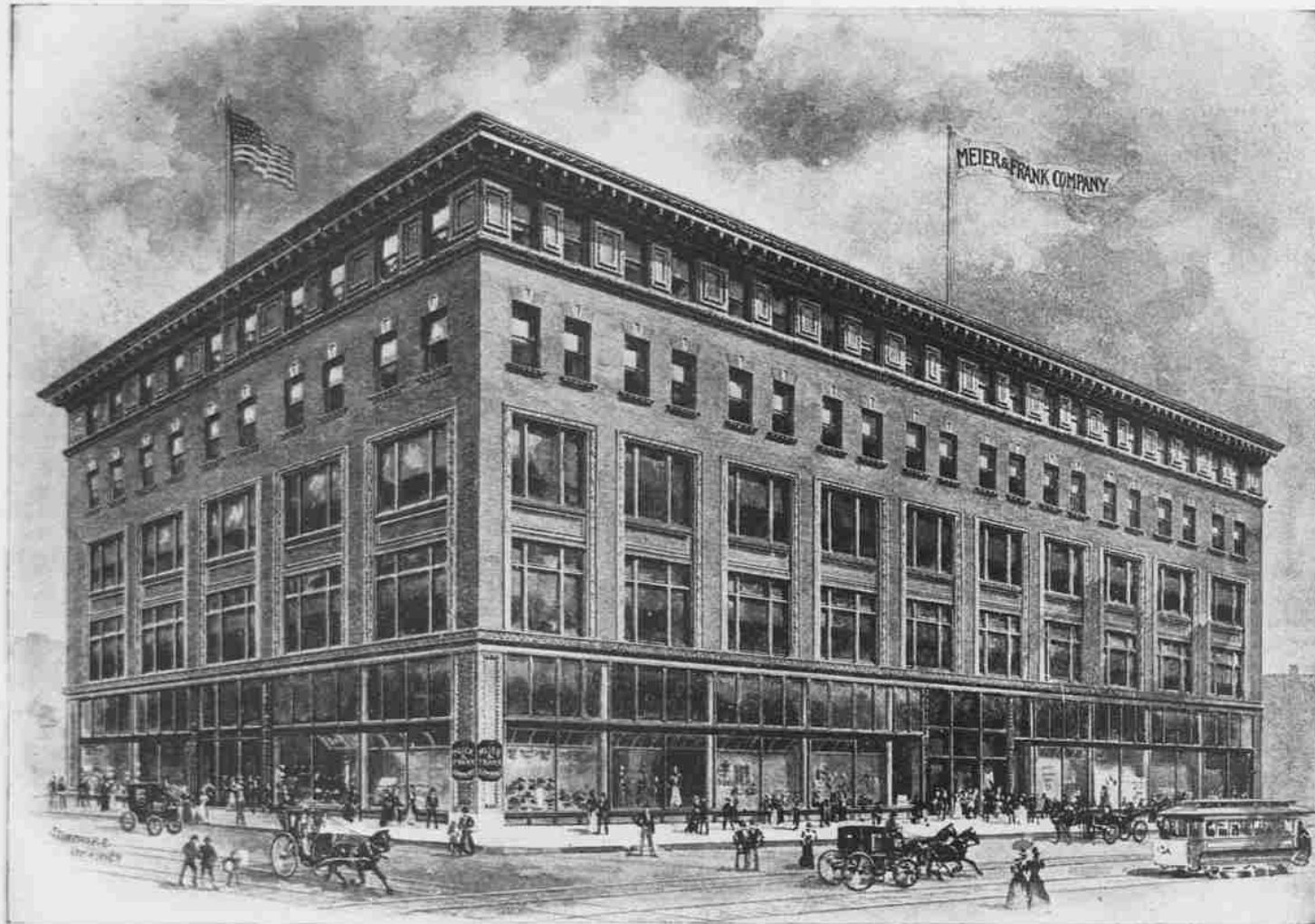
THE LARGEST STORE ON THE PACIFIC COAST, entire Building owned, occupied and used for Mercantile Purposes by MEIER & FRANK COMPANY , Fifth, Morrison and Alder Sts., Portland.

the wheels of numerous factories in Portland is all transmitted by this Company from Oregon City to the metropolis of the Pacific Northwest. This was the first electrical long-distance plant completed in the world. Next to Niagara, Willamette Falls furnish the largest available water-power in the United States.