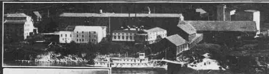
Steamboat Landing at Oregon City