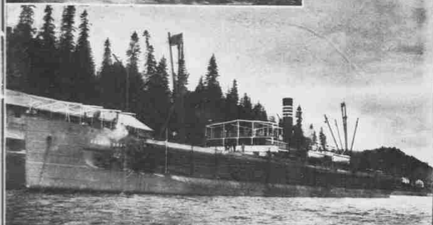
Steamship Orange Branch, 2196 tons. Loaded at Portland with 2,889,348 feet of Lumber for Shanghai, August 24, by the PACIFIC EXPORT LUMBER COMPANY, PORTLAND