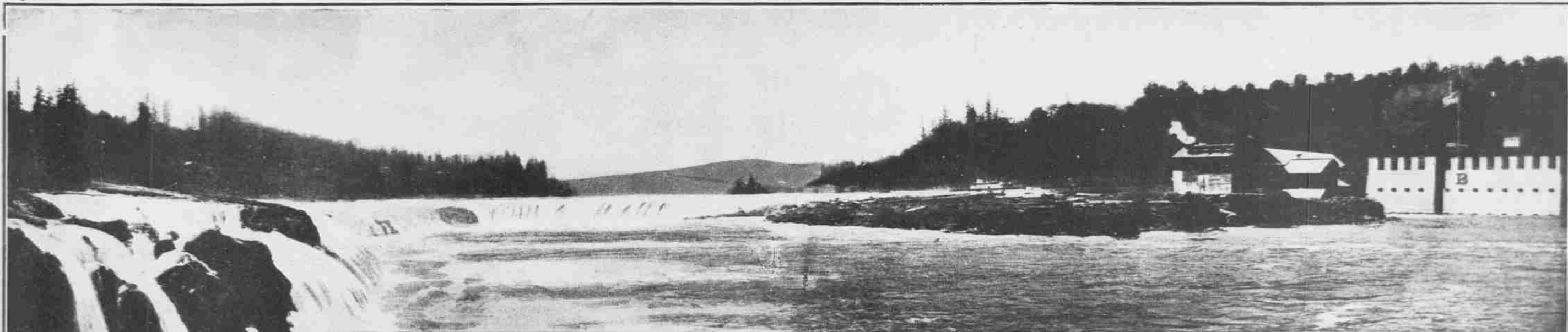
Willamette Falls at Oregon City, twelve miles south of Portland. Site of the extensive plant of the Portland General Electric Company, which controls the power generated by this wonderful waterfall. The electricity for lighting Portland's streets, stores and residences, which runs the cars over miles of thoroughly equipped city and suburban roads and which turns