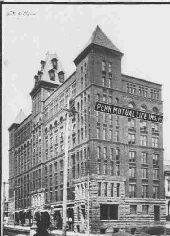
The Marquam Building, Showing Offices of the North Pacific Department of the Penn Mutual Life Ins. Co. of Philadelphia