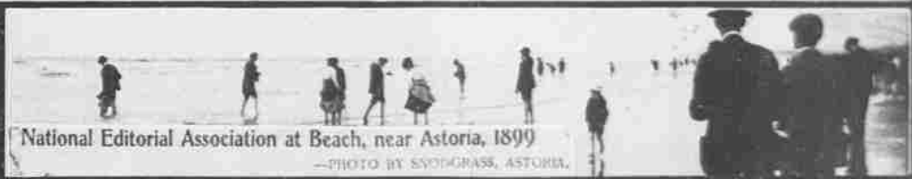
National Editorial Association at Beach, near Astoria, 1899