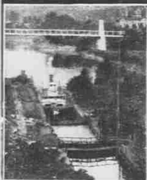
Locks and Canal Around Willamette Falls, Oregon City.