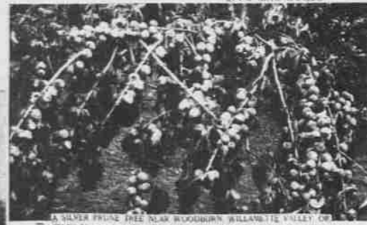
A SILVER FRUIT TREE NEAR WOODBURN, WILAMETTE VALLEY, OR. The tree has been infested by Oregon farmers to that there has been great loss.