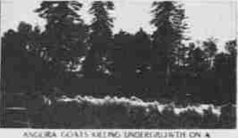
ANGORA GOATS FEEDING UNDERGRASS ON A WILAMETTE VALLEY FARM