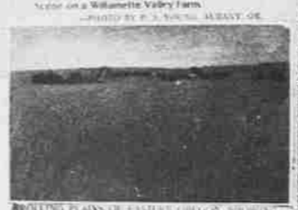
ROLLING PLAINS OF EASTERN OREGON, SHOWING GREAT WHEAT FIELDS