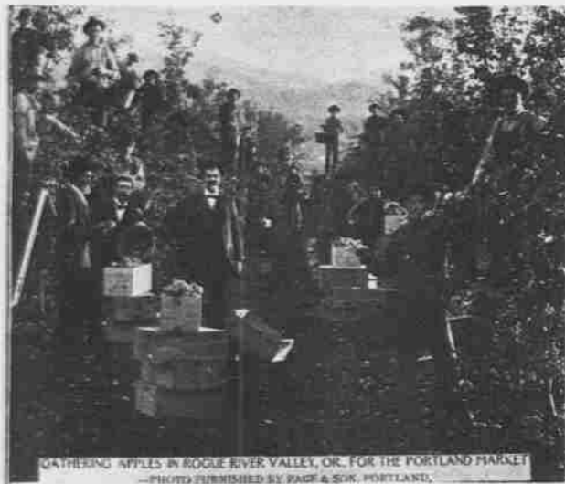
GATHERING APPLES IN ROGUE RIVER VALLEY, OR. FOR THE PORTLAND MARKET