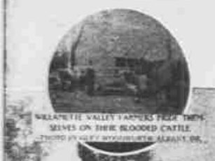
WILAMETTE VALLEY FARMERS FEED THEIR SWINE ON THEIR BLOODED CATTLE.