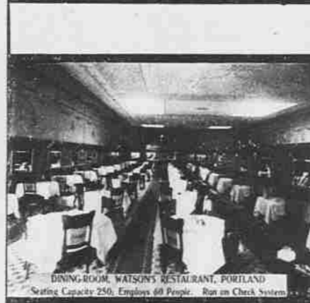
DINING ROOM, WATSON'S RESTAURANT, PORTLAND Seating Capacity 250. Employes 60 People. Run on Check System.