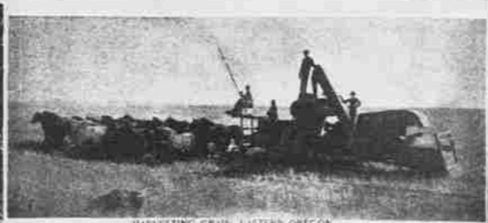
HARVESTING GRAIN, EASTERN OREGON