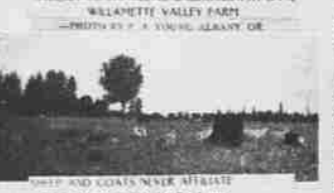
SHEEP AND GOATS NEVER ATTEMPT TO GET INTO THE WILAMETTE VALLEY FARM