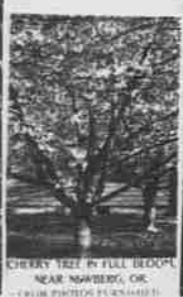
CHERRY TREE IN FULL BLOSSOM NEAR NEWBERG, OR.