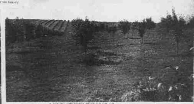
A VINOYD ORCHARD NEAR SALEM, OR.