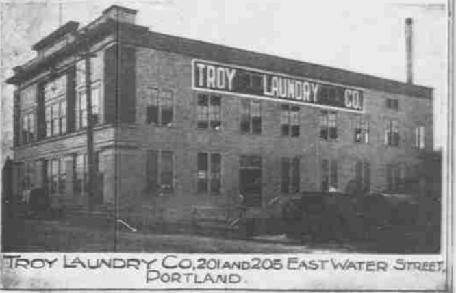
TROY LAUNDRY CO., 201 AND 205 EAST WATER STREET, PORTLAND.

LA CELESTINA MASON, EHRMAN & CO., Portland DISTRIBUTORS