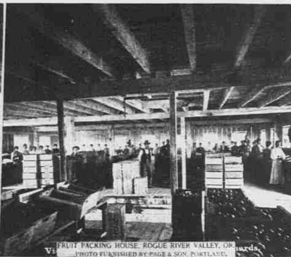
FRUIT PACKING HOUSE, ROGUE RIVER VALLEY, OR.