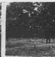
ORCHARD VIEW, NEAR NEWBERG, OR.