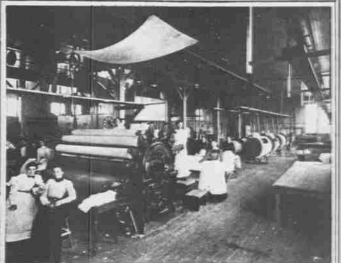
INTERIOR VIEW SHOWING THE WORKS IN OPERATION.