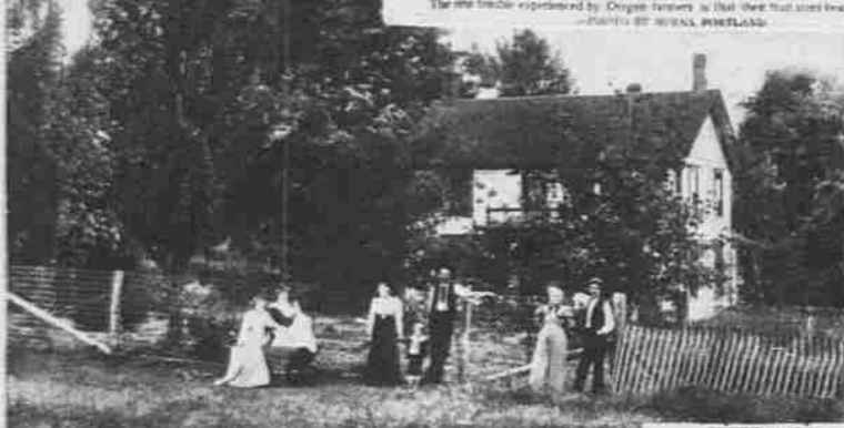
NO HOUSES ARE SO INVITING AS THOSE OF THE OREGON FARMER A Farmhouse in the Middle Hills, Willamette Valley.