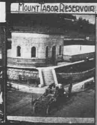
MOUNT LABOR RESERVOIR, PORTLAND WATER WORKS SYSTEM.