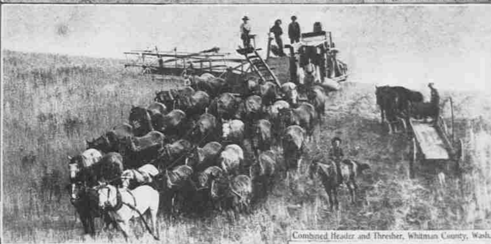
Combined Header and Thresher, Whitman County, Wash.