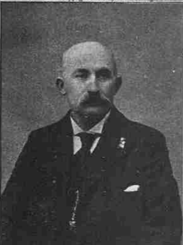
ISAAC BERGMAN Mayor of Astoria, Oregon