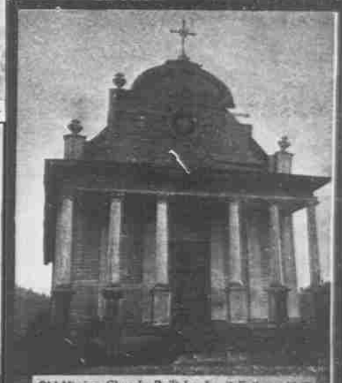
Old Mission Church, Built by Jesuit Fathers, 1843