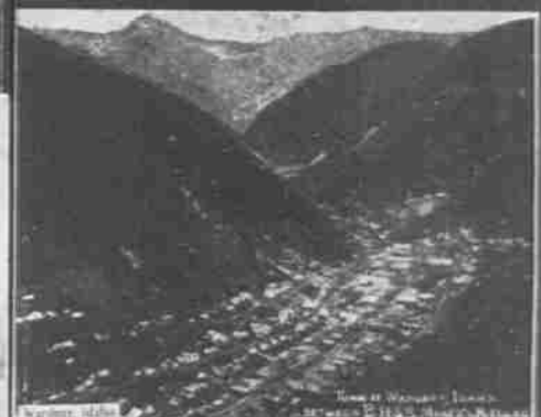
View at Whippoorwill, Idaho