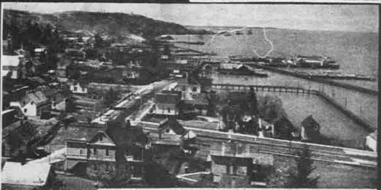
Astoria, Oregon, at Mouth of Columbia River, Showing Shipping District