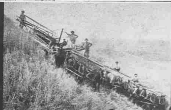
Header and Header Wagons, Whitman County, Wash.