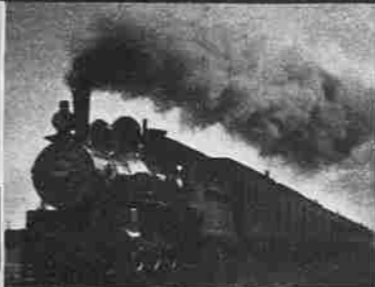
A Northern Pacific Transcontinental Train Entering Portland

One of the great financial institutions of the West. The deposits of this bank now aggregate $5,800,000 (nearly six millions of dollars). Portland's financial and commercial supremacy in the Pacific Northwest can be best appreciated after examining the statements of the First National Bank.