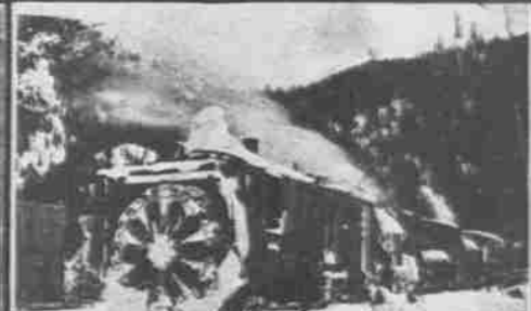
Winter Scene, N. P. R. R. Views in Coeur d'Alene Mining District, Idaho