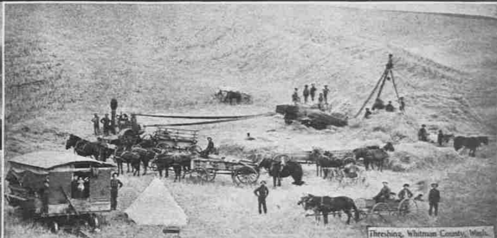
Threshing, Whitman County, Wash.