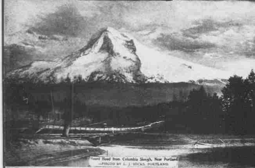
Mount Hood from Columbia Slough, Near Portland