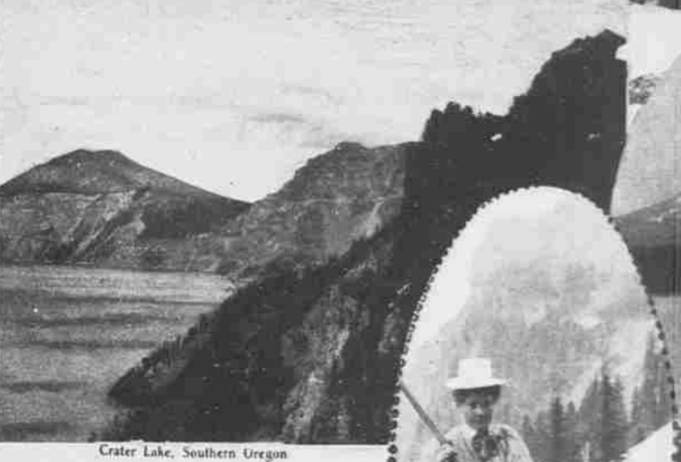
Crater Lake, Southern Oregon