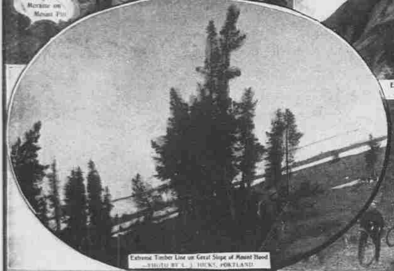
Extreme Timber Line on Great Slope of Mount Hood