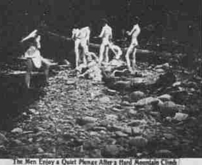
The Men Enjoy a Quiet Plunge After a Hard Mountain Climb