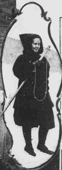
She is Near the Summit of Mount Rainier, and she is Happy