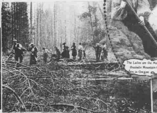
Difficulties Encountered by The Mazamas in Reaching Base of Mount Pitt