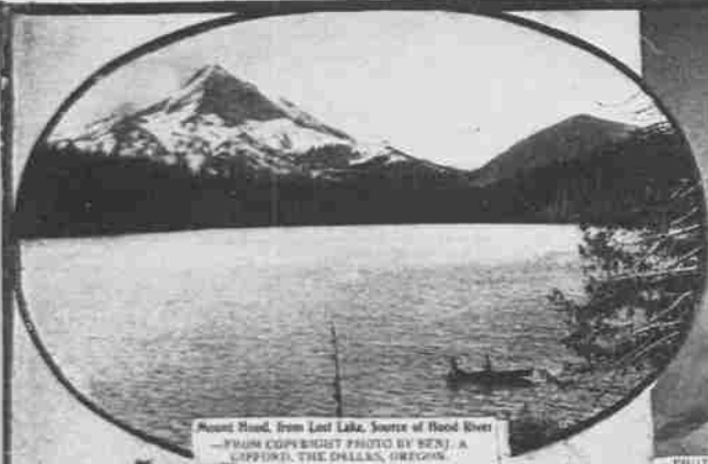
Mount Hood, from Lost Lake, source of Hood River