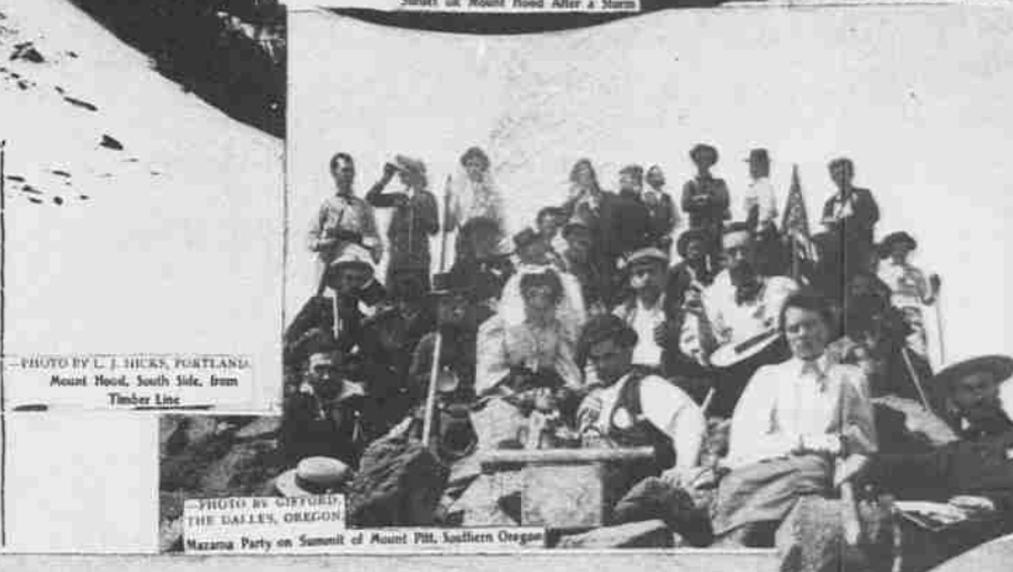
Mazama Party on Summit of Mount Pitt, Southern Oregon