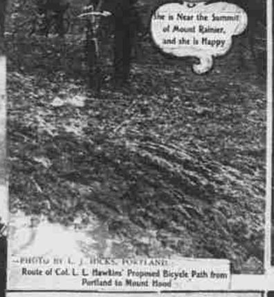
Route of Col. L. L. Hawkin's Proposed Bicycle Path from Portland to Mount Hood