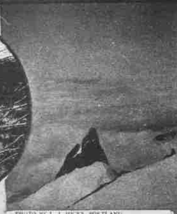
Illumination Rock, Near Summit of Mount Hood