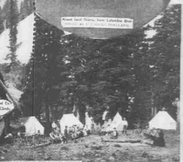
Mazamas Encamped at Crater Lake