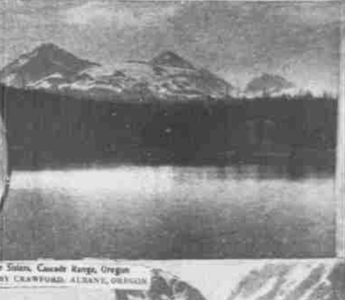
Three Sisters, Cascade Range, Oregon