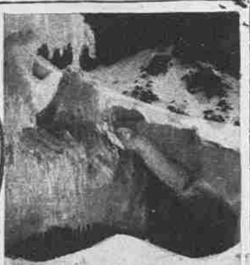
The Deep Ice Caves of Mount Hood