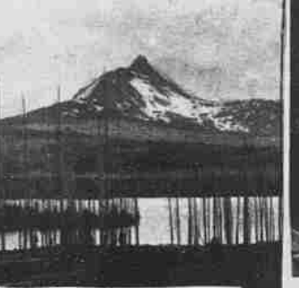
Mount Washington, Cascade Range, Oregon

A PAGE FOR THE MAZAMAS The Mazamas, a strong organization of representative men and women, have made the many snow-capped peaks of the Cascade Range famous. These mountaineers make regular annual excursions to different points in the fastnesses of the interior mountainous districts, where the loftiest heights, reaching an elevation exceeding 14,000 feet are scaled. The Mazamas have illuminated the summit of Mount Hood at midnight, so that the great ball of red fire was plainly seen for more than 100 miles distant, and they have reached the summit of every notable peak of the Cascades. The most prominent snow-capped mountains of this range are Mount Pitt, beginning on the south, Diamond Peak, Mount Washington, Three Sisters, Mount Jefferson and Mount Hood, in Oregon, and Mount Adams, Mount St. Helens, Mount Rainier and Mount Baker, in Washington.