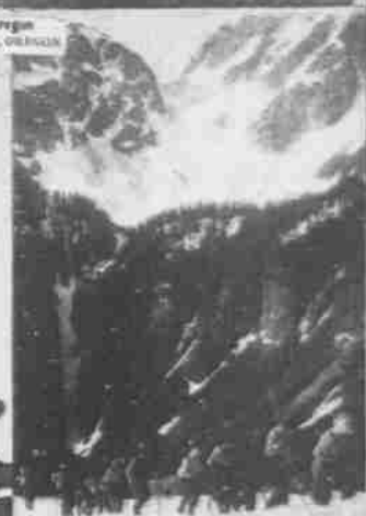
Mazamas Climbing Mount Tahale, Washington