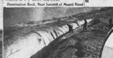
Exhausting Sport of Crossing the —Great Glaciers of Mount Hood