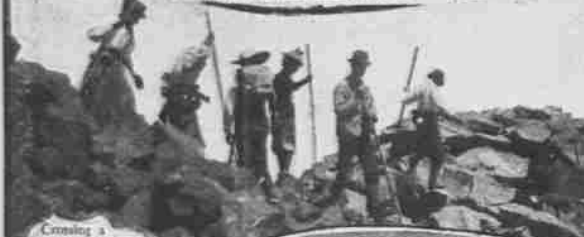
Crossing a Moraine on Mount Pitt