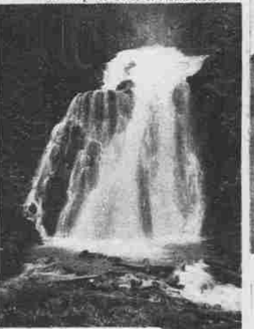
Yocum Falls on Government Camp Creek, Near Mt. Hood