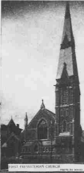
FIRST PRESBYTERIAN CHURCH