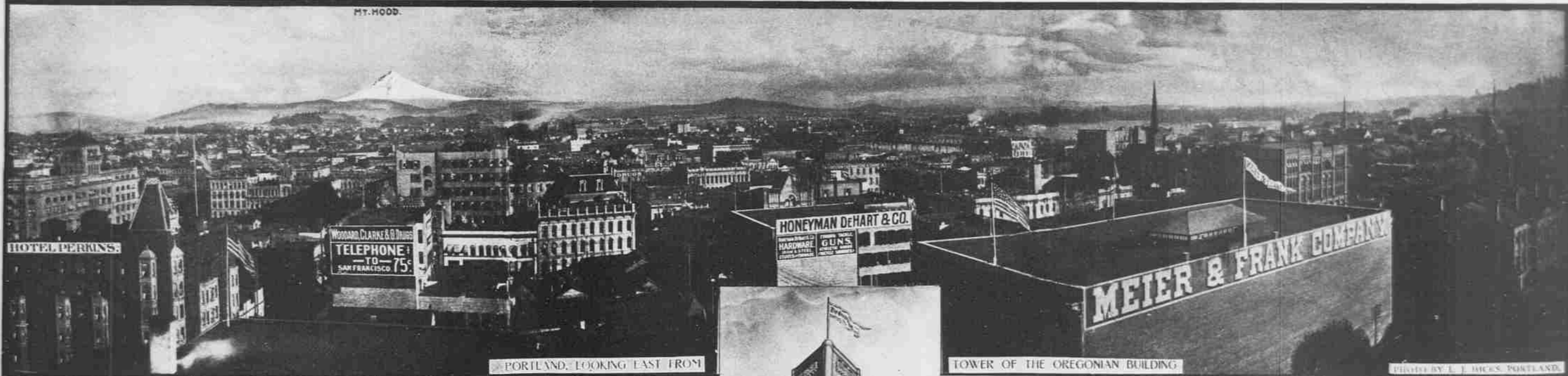
PORTLAND, LOOKING EAST FROM