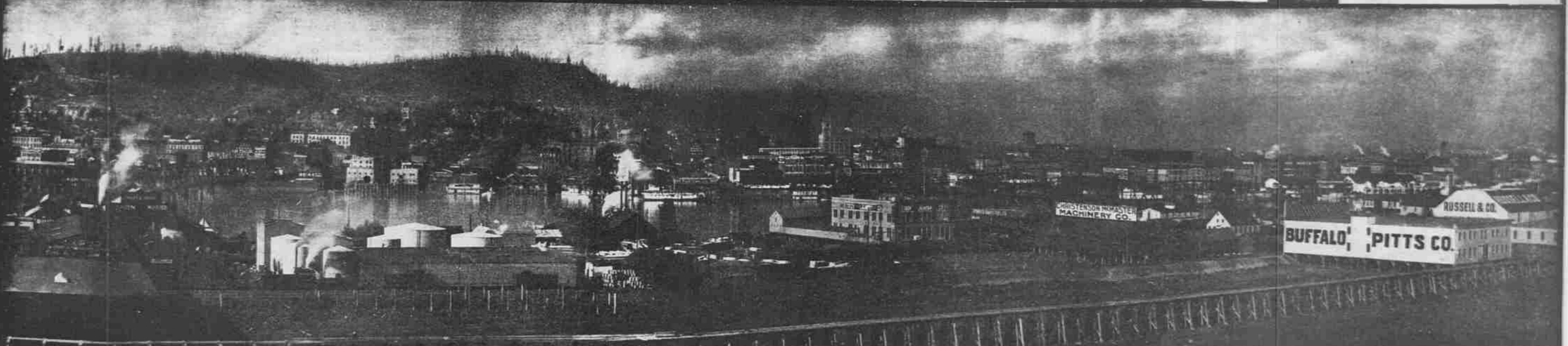
PORTLAND, FROM NEW MANUFACTURING AND WHOLESALE DISTRICT ON EAST SIDE