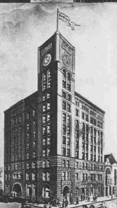
THE OREGONIAN BUILDING Tallest Edifice in Portland. Absolutely Fire-Proof and Modern in all of its Appointments.