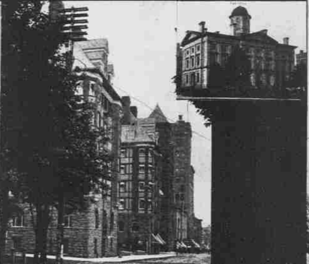
SIXTH STREET Showing Hotel Portland, The Marquam, The Oregonian Building