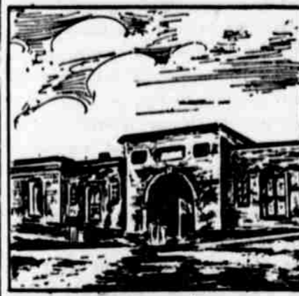
HISTORIC FORT M'HENRY.