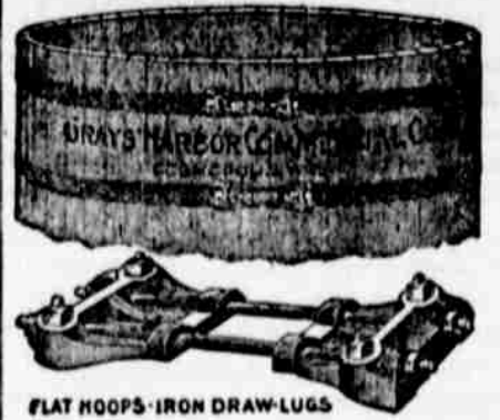
FLAT HOOPS-IRON DRAW-LUGS