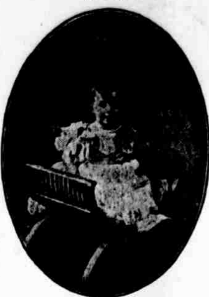
THE CZAREVITCH ALEXIS.

Of all the royal children of Europe the condition of none appears more dubious than that of Alexis, the czar- evitch of Russia and only son of the czar. He was born in August, 1904, at the very darkest moment of the fortunes of Russia during the war with Japan. Since then the storm clouds have become even blacker, for revolutionary conditions are now rife throughout the Muscovite empire until the very existence of the throne is menaced. Not only is it a question whether the czarvitch will grow up to inherit the throne, but it is even a problem whether the czar shall be able to retain his crown. Surely before he becomes of age Russia shall have passed through many political and economic changes.