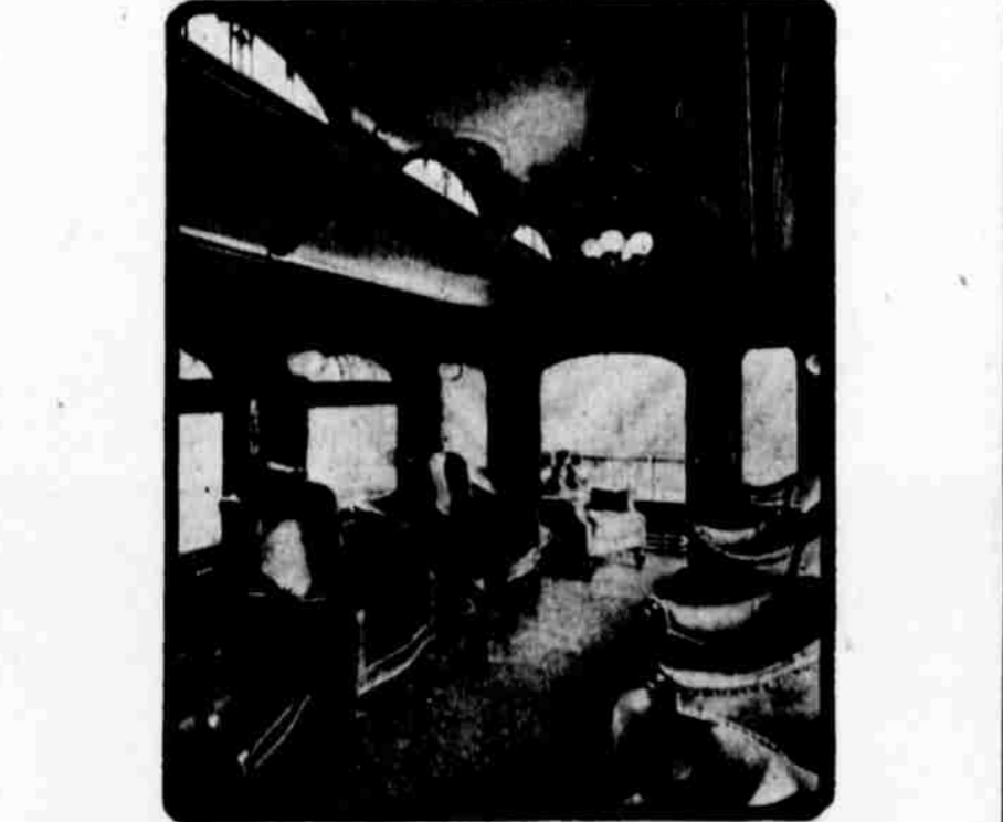
Interior of Compartment Observation Car on Great Northern's New Train, the "Oriental Limited."

The day that a woman puts away her first dollar toward buying a piano, she decides in what corner of the parlor she intends to put it.