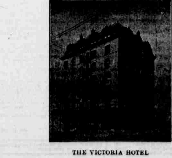
THE VICTORIA HOTEL